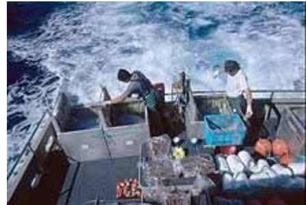
Longline vessel fishing out of Mooloolooba setting the gear

Dusky and whiskery sharks are assessed as overfished. Other species caught in these fisheries are sandbar sharks, hammerhead sharks, wobbegongs and school sharks. Managers of these fisheries have also introduced restrictions to reduce catches of overfished species.