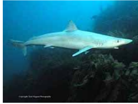
School shark-a species targeted by the Australian Southern Shark Fishery

The size of the holes in the nets depends on the species being fished. The nets are usually several hundred metres in length. They are left in the water for 2–6 hours and are then hauled in.