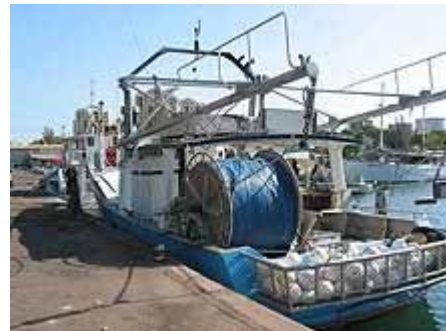
Shark gillnet vessel

This is the most common fishing gear in shark fisheries. They are suspended vertically in the water near the surface or near the sea floor.