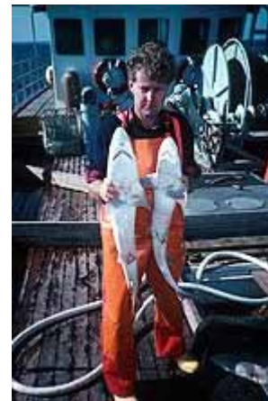
School shark and gummy shark aboard vessel in Bass Strait