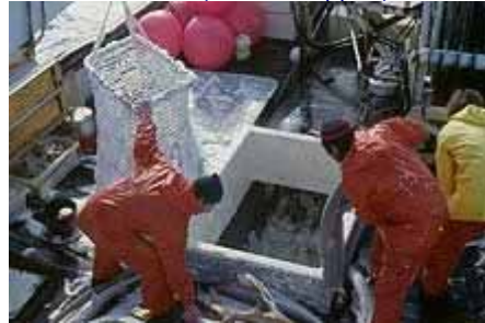
Shark gillnet vessel-storing the catch