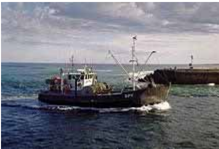
Shark gillnet vessel returning to port in southern Australia

This is the most common fishing gear in shark fisheries. They are suspended vertically in the water near the surface or near the sea floor.